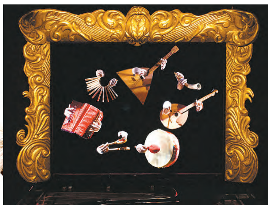
“PETRUSHKA”: Instruments played by invisible musicians open the piece, which re-creates the Ballets Russes classic, left. It will play at the Lansburgh Theatre.